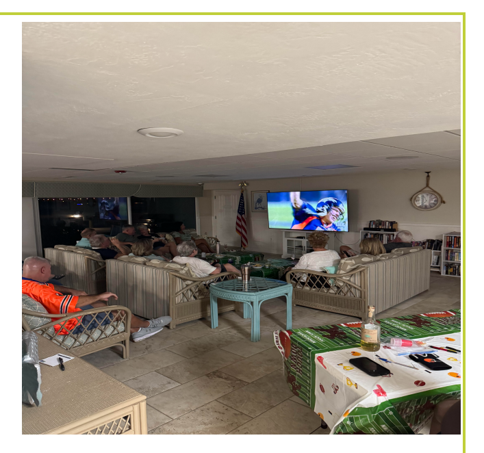
Super Bowl Party